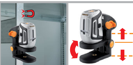
Wall mount magnetic